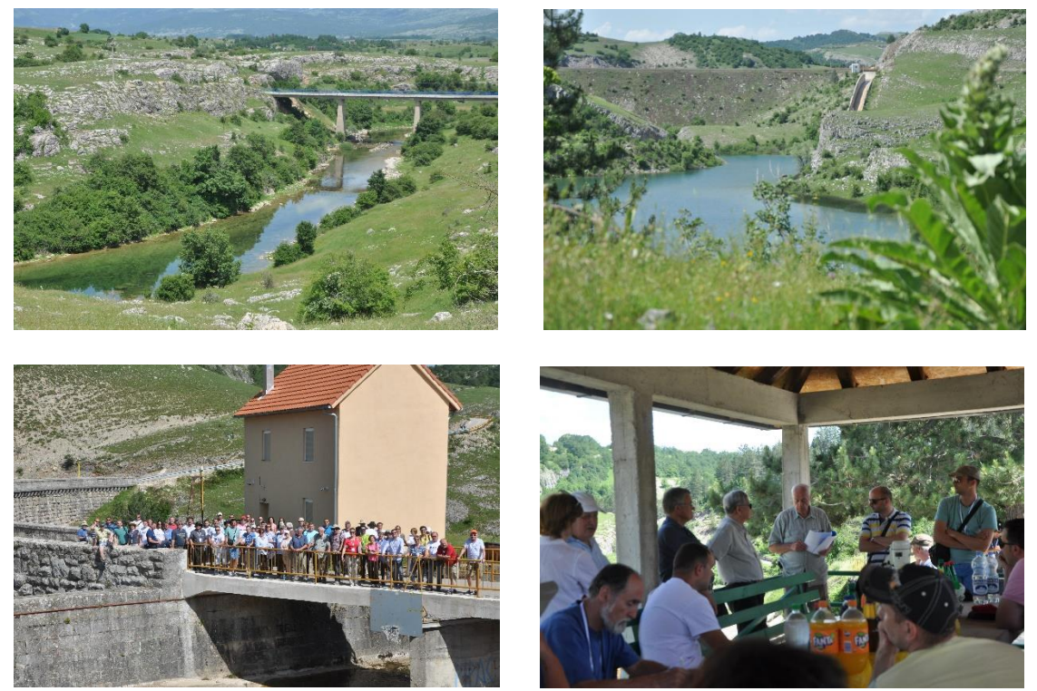
Natural beauty of Herzegovinian karst and dam and reservoir Klinje

During the bus ride, participants also had opportunity to see Nevesinjsko polje, temporary river Zalomka, as well possible zone of reservoir. Final stop was on the dam and reservoir Klinje, where participants rest a little bit and enjoyed in natural beauty of the area, while they listened an oral lecture of Prof. Dr Milanović. Whole day excursion was finished with lunch at the national restaurant Mosko near the Trebinje city, where participants enjoyed in traditional food.