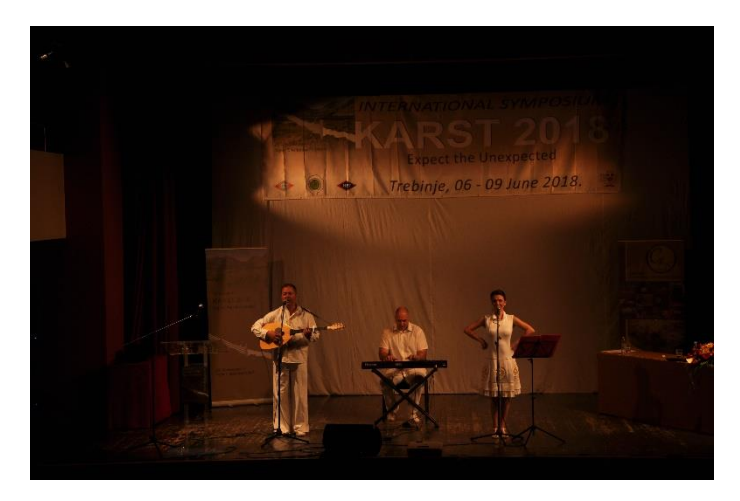
Ethno group Teodulia

During whole ceremony, guest could enjoy in the lovely sounds of ethno group Teodulia which performed rather interesting and nice old songs from this region.