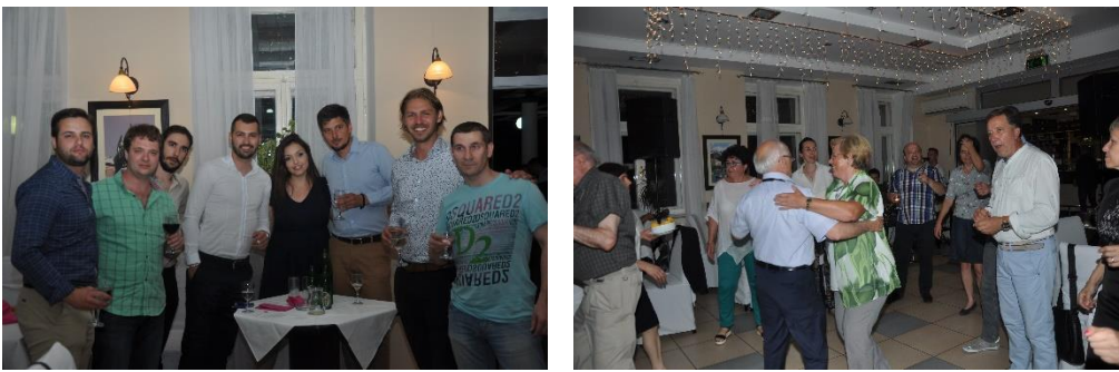
Gala dinner in the Hotel Leotar